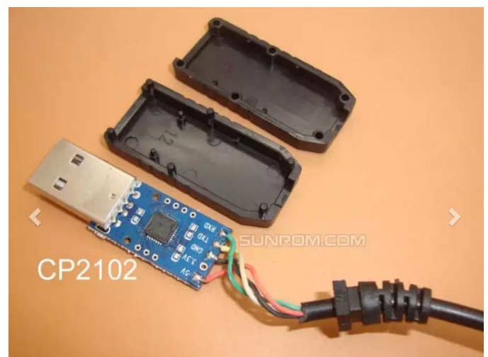
Figure 3.3 serial communication port

Serial data communication needs often dictate the frequency of the oscillator because of the requirement that internal counters must divide the basic clock rate to yield standard communication baud rates